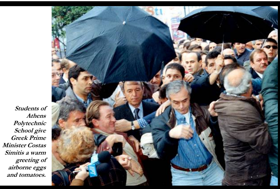
Students of Athens Polytechnic School give Greek Prime Minister Costas Simitis a warm greeting of airborne eggs and tomatoes.

WELL-KNOWN PROLETARIANS ATHENS - 18 JUNE, 1998